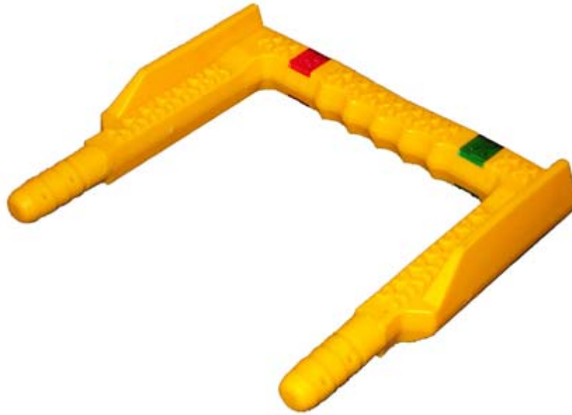
MWT - 253

The Miyama Nextep plastic encapsulated step irons are designed and manufactured with the latest technology available. The steel core of our step irons is of the Japanese Standard - JIS G3539, and this steel is encapsulated in the highest quality BC-6C polypropylene.